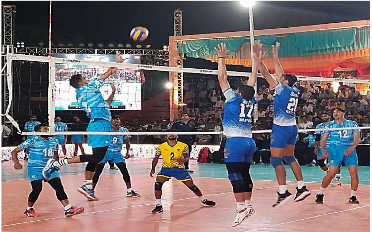
Moment of action between Railways and Services Men Teams