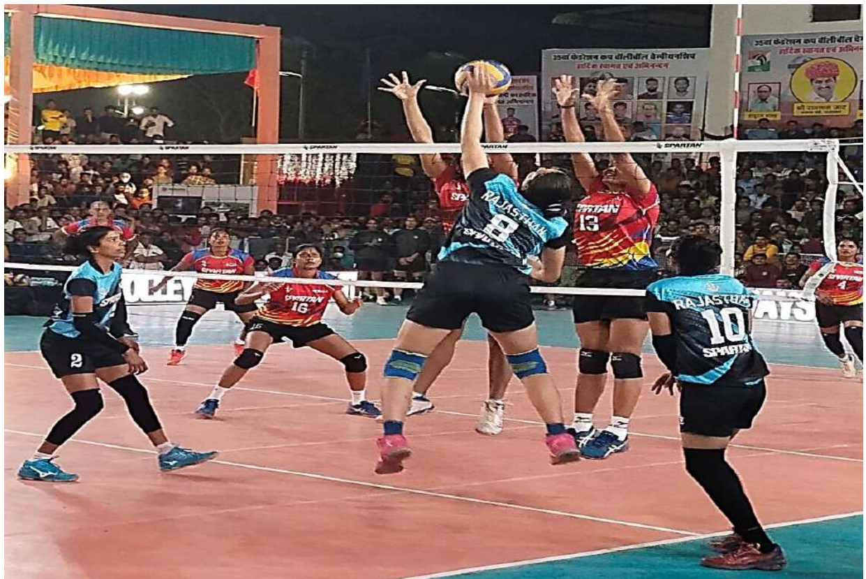
Moment of action between Kerala and Rajasthan Women teams